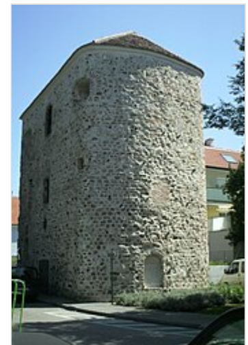
The Salz Tower ( Salzturm ) in Tulln, Lower Austria, the former western horseshoe tower ( Hufeisenturm ) at Comagena

The increasing number of fortifications that were falling into decay were renovated again under Emperor Valentinian I (364–375) and upgraded to conform to the latest military tactics. Walls were thickened, and defensive ditches renewed. In addition, towers were built along the walls, such as a watchtower discovered near Oberranna in 1960. These fortifications lasted only another hundred years before the fall of the Roman Empire. In 488 the land of present-day Austria was cleared. The Roman fortifications along the lower courses of the Danube were overhauled once again, especially under