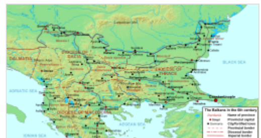
The Lower Danubian Limes and the northern Balkans in the 6th century. Depicted are the provinces, major settlements and military roads