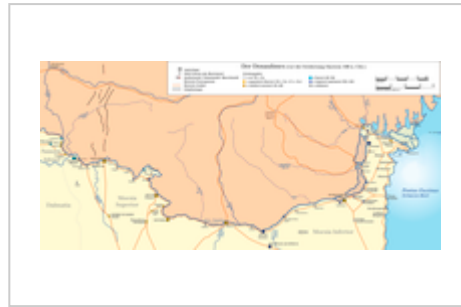
A snapshot of The Moesian Limes of one period in present-day Bulgaria and Romania