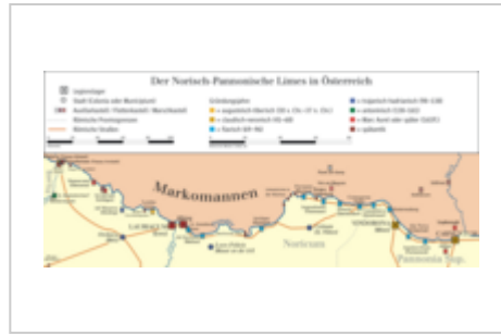
The Noric-Pannonian Limes in present-day Austria