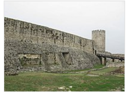
Remains of the castrum in the Belgrade Fortress