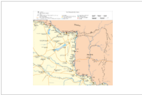
The Pannonian Limes in present-day Slovakia, Hungary, Croatia and Serbia